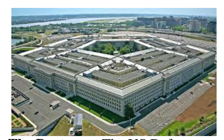
The Pentagon : The US Defense Department headquarter